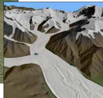
Visualization using a 5m-resolution DEM of Trident Glacier, Alaska.