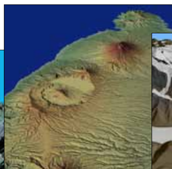
DSM in shaded relief of Bali, Indonesia.