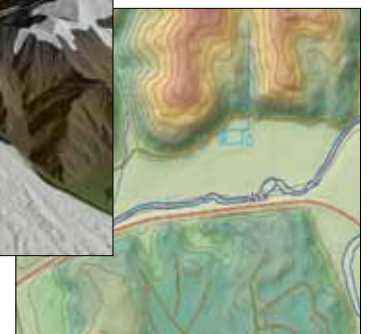
TLM of Mud River, West Virginia.