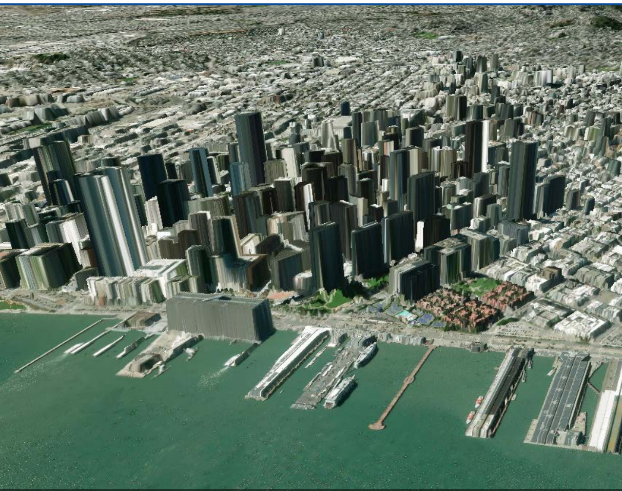
Intermap's 1m Elevation Data

Intermap's elevation models can be layered with satellite imagery to provide realistic 3D visualization