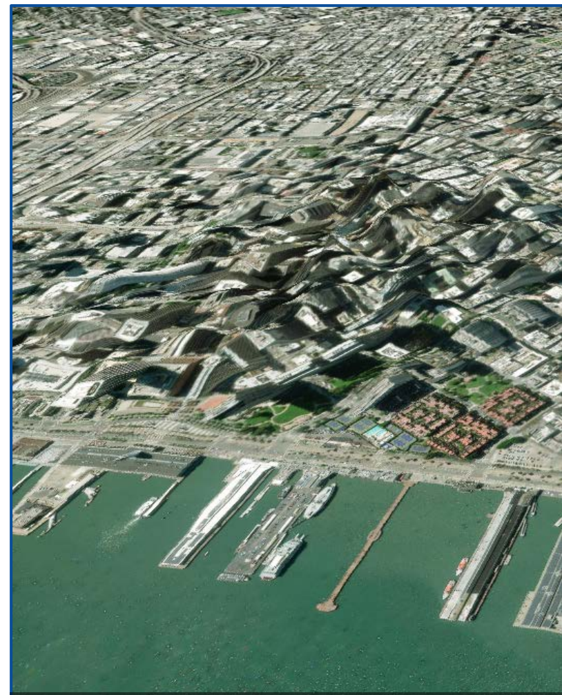
Free Elevation Data